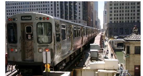
A view of the upper deck at the N. Wells St. bridge (map #9)