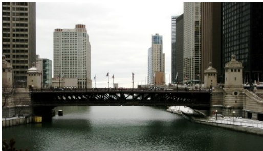
N. Michigan Ave. Bridge (map #3)

THE W. LAKE ST. BRIDGE IS THE FIRST DOUBLE DECK BASCULE BRIDGE (MAP #11).