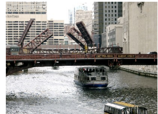
Looking north along the South Branch Chicago River from the W. Madison St. bridge (map #14)

WELCOME TO CHICAGO, MOVABLE BRIDGE CAPITAL OF THE WORLD!