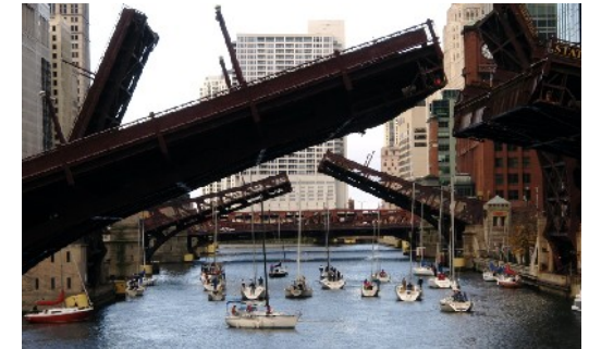
Looking west along the Main Branch Chicago River from the N. State St. bridge (map #5)

WELCOME TO CHICAGO, MOVABLE BRIDGE CAPITAL OF THE WORLD!