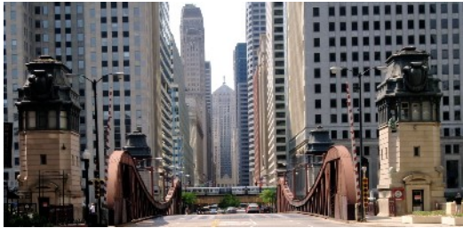
N. La Salle St. bridge - gateway to the Loop (map #8)

THERE ARE 36 MOVABLE BRIDGES IN CHICAGO AND 18 ARE IN THE LOOP ALONG THE CHICAGO RIVER.