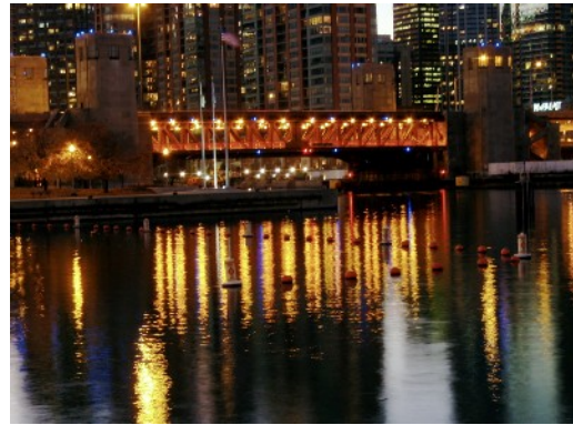
N. Lake Shore Dr. at night (Map #1)