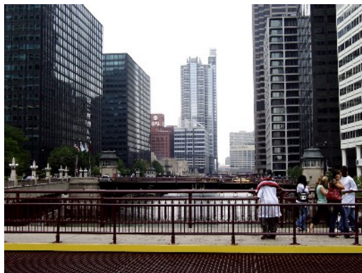
Looking north from the deck of the W. Jackson Blvd. bridge (map #17)